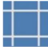
QUEEN ANNE (C)