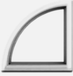
Special Shape Window