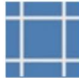
QUEEN ANNE (F)