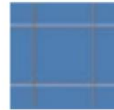
QUEEN ANNE (E)